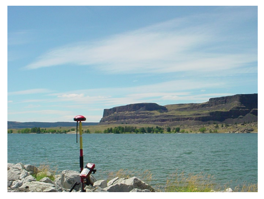
Longer baselines: this site near Steamboat Rock in central Washington is 50 kilometers from each of the adjacent RTN reference stations; consistent and reliable corrections available on-demand 24/7

Reference stations, working together as a network, can address directly several of the largest sources of error, and do this in real-time; positional integrity of the reference stations ( i.e. , these stations do not move very much, and if they do this movement is accounted for through constant monitoring), orbits ( i.e. , by introduction of higher-precision