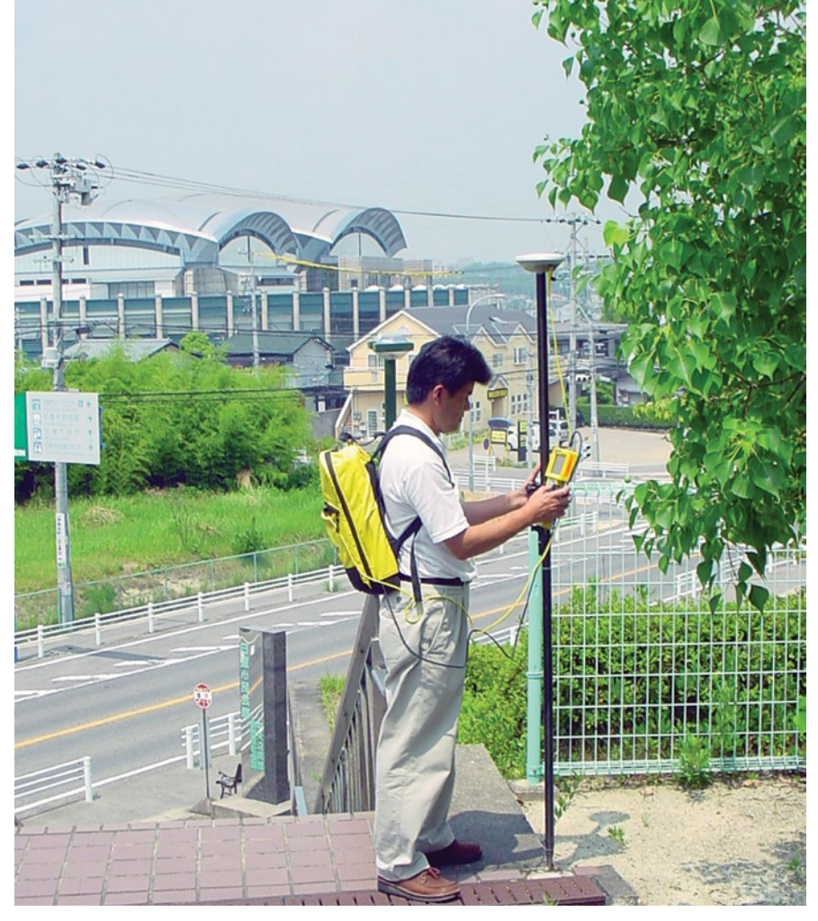
Instant access: this local surveyor in Nissen Japan demonstrated the ease of accessing corrections from the national 1200 station array via one of two commercial providers. Corrections are available by a number of means, including cellular, radio, and wireless.

The good news is, that RTN can, and do (if properly implemented) provide consistent, verifiable, and rapid results; a suite of solutions that can (if properly executed) be applied to nearly every positioning aspect of the surveying industry. Of equal importance is the news that these networks for the most